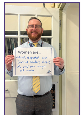
International Women's Day